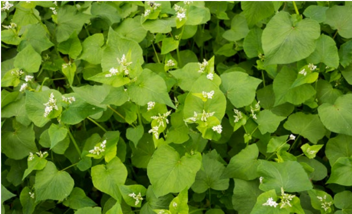
Buckwheat begins to bloom white flowers.