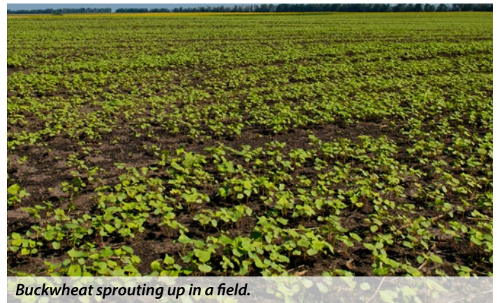
Buckwheat sprouting up in a field.